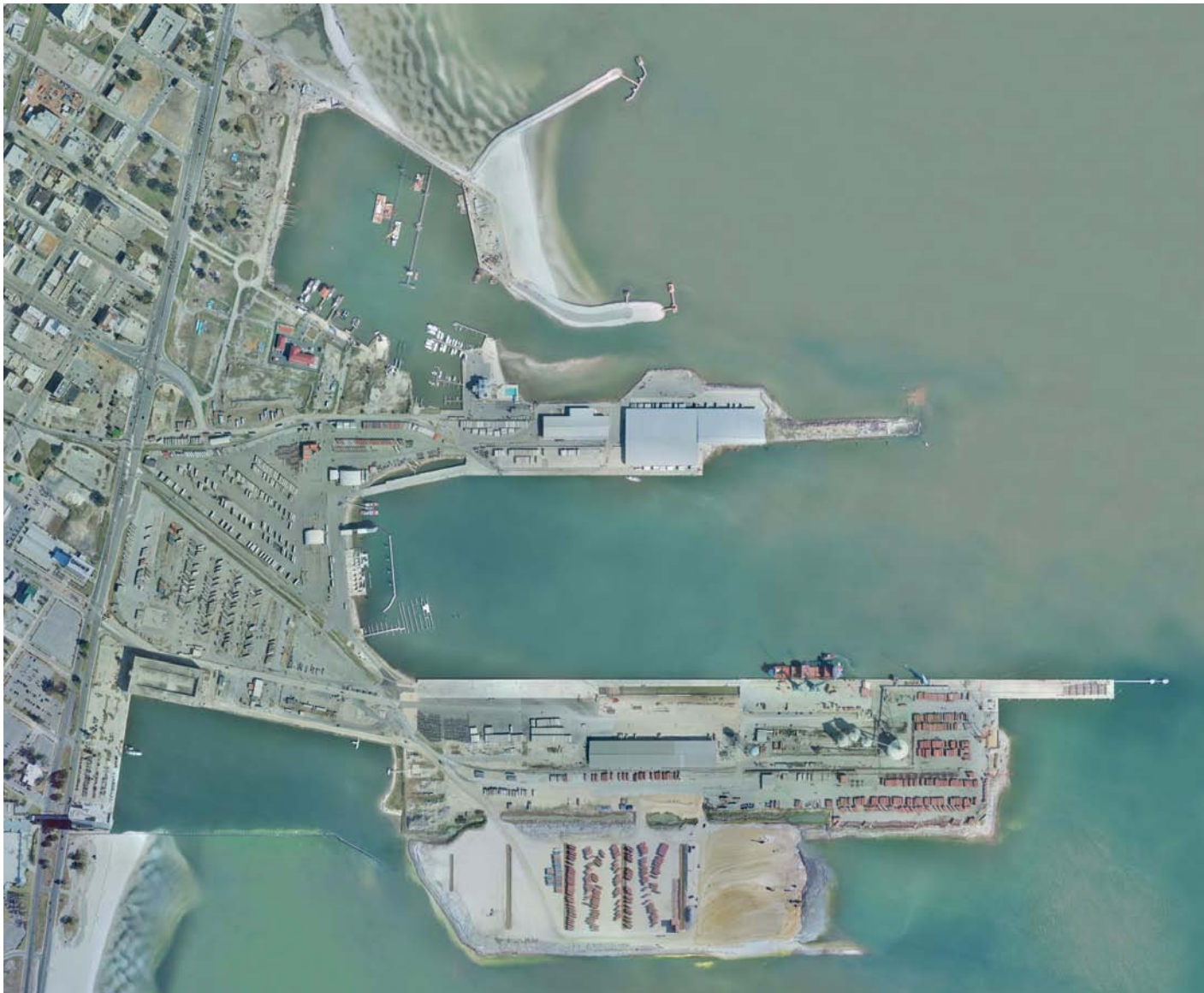
Port of Gulfport Restoration Program