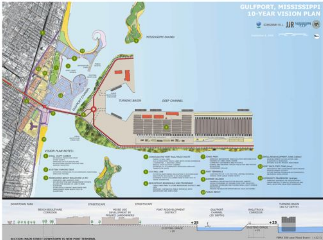
Port of Gulfport Restoration Program